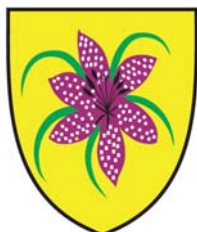
Municipality of Trzin